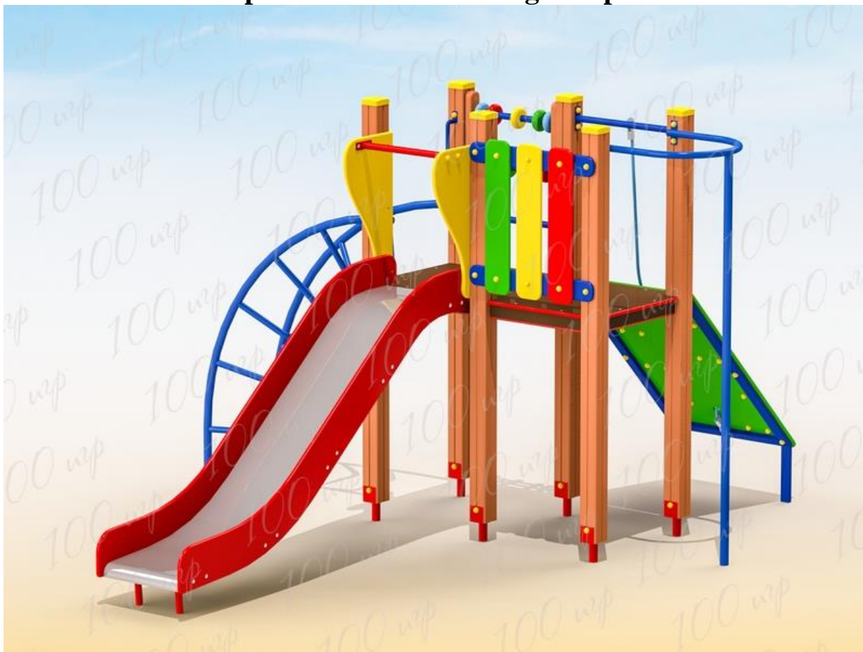
Equipment for children's playground